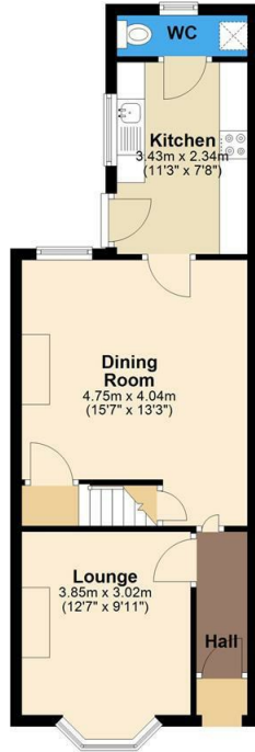
Ground Floor Approx. 43.2 sq. metres (464.9 sq. feet)